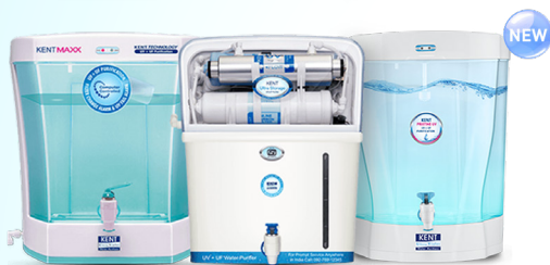
UV & UF Water Purifiers