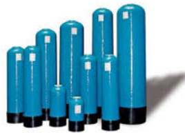
Industrial Water Treatment Systems