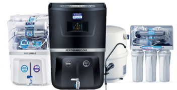
RO Water Purifiers