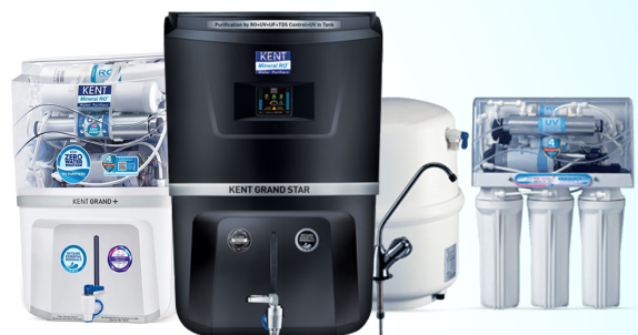
RO Water Purifiers