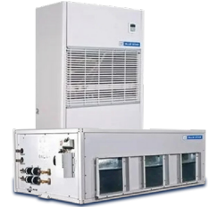
Packaged ACs & Ducted Splits