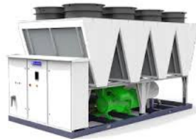
Industrial HVAC Chiller