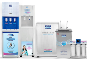
Commercial RO Purifier